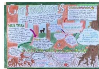
Previous national winners