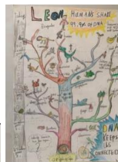
Previous national winners